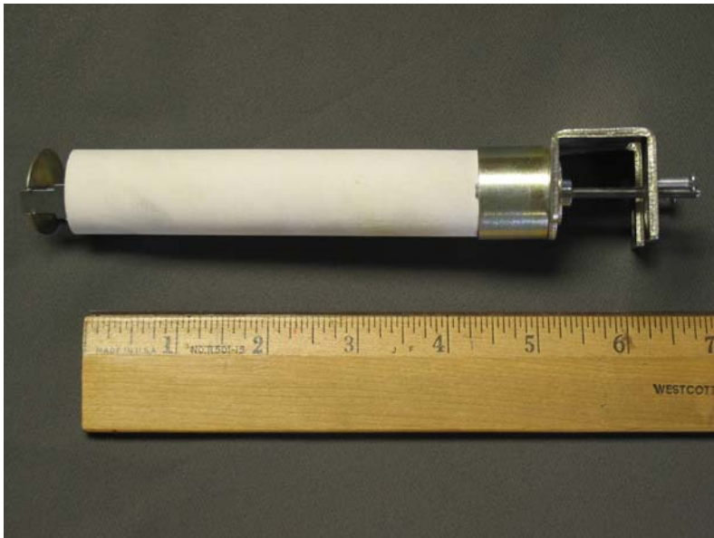
Tube Assembly S 6 – Short Bracket Total Length 6”

Orton Tube Assemblies mount to the faceplate of the KilnSitter/AutoCone and are available with a short or a long bracket. Lengths are available in ½” increments. Tube assemblies include cone supports, sensing rod, swivel, bracket, gauge and two flathead screws. Back plates will also be included beginning May 30 th , 2009 to replace bayonet style assemblies.