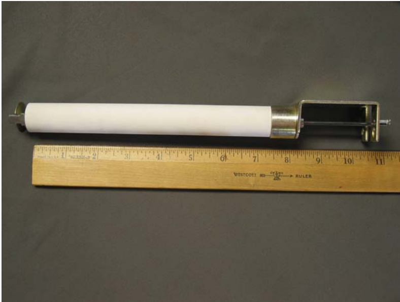
Tube Assembly L 10.5 - Long Bracket Total Length 10 ½”